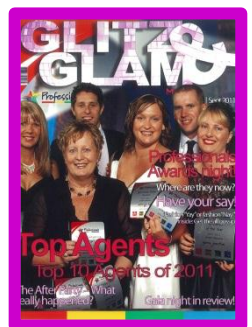
Right: Having fun with our own pretend magazine cover!